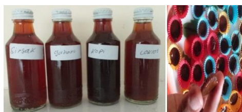
Figure 1. Palm sugar mix MPTS leaves infusion product. Raw material before solidified (left), candy product after solidified (right)

The result has shown that MPTS leaf infusion can be mixed with Arenga pinata sap water to produce palm sugar candy. This candy is an innovative product that can support the diversification of Arenga pinata utilization on Lombok Island. Palm sugar candy products have different characteristics based on the MPTS leaves raw material (Figure 1).