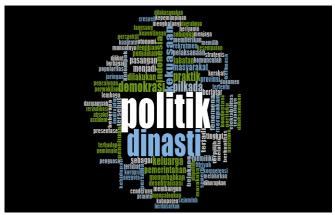
Figure 1. Nvivo 12 Plus Word Cloud Analysis of Political Dynasty Practices

2020). The political practice of dividing resources from incumbents is used to increase the electability of prospective members of a political dynasty so that they can win and obtain political office (Aida Fitris Ahmalia, 2020). Political dynasties are carried out by design from the start and some also happen by chance. Where designed dynastic practices have been going on for a long time which contributes to a very strong family network. Meanwhile, by chance, political dynasties occur by suddenly replacing the previous power to maintain and maintain power (Sari et al., 2022).