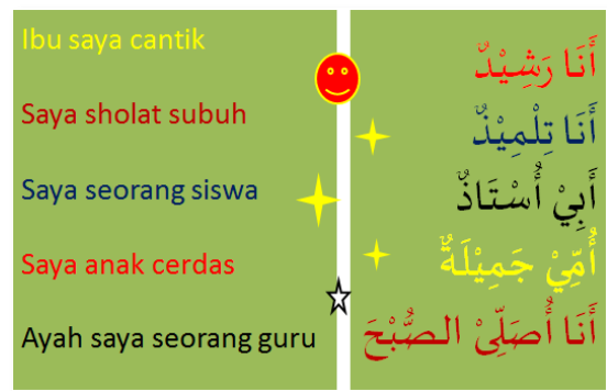
Figure 2. Student qira'ah text

Apart from group work, the analytical strategy in learning maharah qira'ah is also carried out individually. This is based on the length of the reading text. The steps taken by the teacher in the analysis strategy are: (a) The teacher designs learning attractively. The material taught is pictorial and colorful to attract students' attention and interest in learning. (b) The teacher distributes qira'ah texts to students. The text is taken from the 2013 curriculum textbook that is being studied. Sometimes teachers also quote qira'ah texts from the internet and youtube, adjusted to the teaching material. The text given to students is in the form of short sentences composed of only two to three words in Arabic. As below: