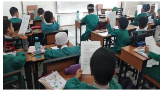
Figure 2. Students fill in feedback after participating in PkM activities

Handouts contain explanations of the content presented by the PkM team. An explanation of the importance of web security starts from how to browse the web safely, the characteristics of malicious programs, viruses, or spam well that must be avoided as as solutions \mathbf{SO} that devices (laptops/smartphones) are protected from malicious programs. Participants (primary school students) are reading PkM material provided by the PkM team.