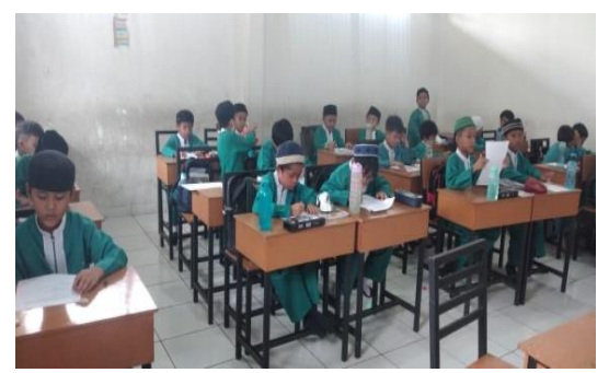
Figure 1. The atmosphere of PkM activities

The Zaadul Ma'ad Boarding School teachers agreed to the proposed PkM proposal. The Zaadul Ma'ad Boarding School teachers welcomed this PkM activity. PkM activities are carried out according to the planned schedule, on November 29 2023 in the Zaadul Ma'ad Boarding School classroom. The participants in PkM were very active in listening to the presentation and also reading the handouts given by the PkM team as seen in Figure 1.