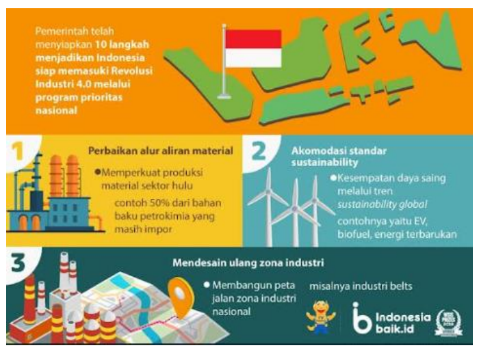
Figure 1. The Priority of Making Indonesia 4.0 (source: indonesia baik.id)

However, a program called the "Making Indonesia 4.0" masterpiece blueprint was launched in 2018 by the Indonesian government and aims to answer this question. This was done in order to catch up technologically with countries like Malaysia and Singapore. Human Resources (HR) enhancement is one of 10 programs of Indonesia's program, which was introduced in January (Hariharasudan & Kot, 2018). To improve the quality of life in Indonesia, Sukartono (2018) claims that human resources are Indonesia's most significant capital. Due to Indonesia's people resources, the country is capable of transforming its educational paradigm from the one of the past (Airlangga, 2019), as shown in Figure 1.