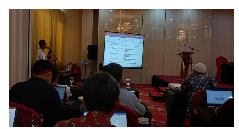
Figure 3. The Discussion Session with Training Participants

Every area of human life has been affected by digital technology from its birth in 2016, according to Lukita and colleagues (2020), this is one of the reasons for the emergence of Indonesia's education 4.0. Prerequisites for the universal implementation of education 4.0 include enhancing the overall quality of technology. Education and competition reforms are creating a global shortage of work specialists who know how to make the most of these changes for the better. The idea of international rivalry in educational technology is gaining traction. Indonesia will be able to catch up and prevent delays in the training of digital technology experts thanks to the adoption of education 4.0 in schools. Indonesia will be able to compete with other countries in the future because of technological improvements and its global economic market. There are questions from participants during the debate of this topic about the qualities of Indonesian education 4.0 that allow it to compete with other countries, as shown in Figure 3.