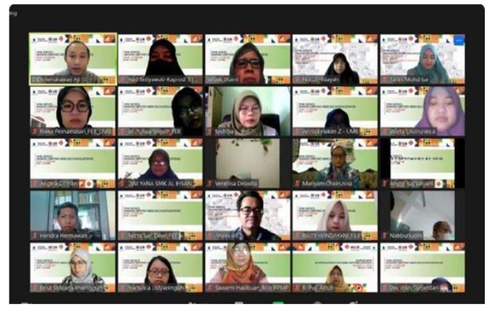
Figure 2. Online Activity of Community Services

In addition to Islamic stock, the socialization activities also explained how to carry out the screening process in determining that the shares were included in Islamic stock. At the same time, the Islamic stock screening process includes business screening and financial screening. Some documentation of the implementation of community service activities in the form of socialization and counseling to increase the knowledge of the young generation related to Islamic investment, Islamic capital market, and Islamic stock are as shown in Figure 2.