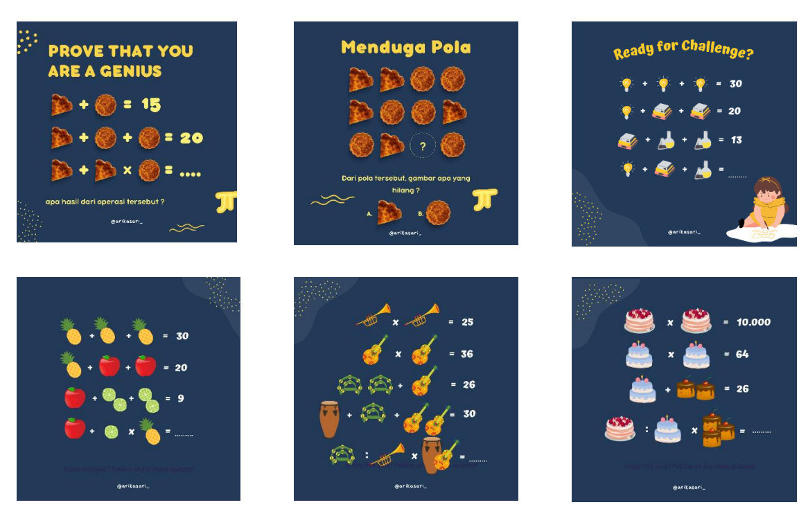
Figure 2. Infographic Display on Instagram Sub Algebra Addition Material

Figure 2 shows the results of the media script writing step, at this step it has also entered the prototyping stage, namely the production step for display on Instagram. Beside that production step is the step where everything that is arranged in the design will be produced or implemented into a media. Before being tested on students for the seventh step, this infographic will be validated first to 1 material expert and 1 media expert to see the feasibility of the infographic being developed as a learning media. Judging from the data from the validation test results by material experts, the percentage of the overall results obtained is 93%. Based on the eligibility criteria that have been determined, it can be said that infographics through Instagram as a strengthening of students' understanding are included in the valid and appropriate category for use in the learning process. The responses from material experts are: improvements to writing errors. Then for the data from the media expert validation test results, the percentage of the overall results obtained is 94%. Based on the eligibility criteria that have been determined, it can be said that infographics through Instagram as a strengthening of students' understanding are included in the valid and appropriate category for use in the learning process. The responses obtained from the media expert validation test are: improvements to writing errors and the addition of a task sub menu in the highlight section.