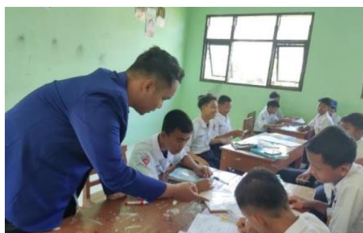
Figure 4. Worksheet's implementation activity

After validation, the worksheets was tried out in a class of 28 students with various types of adversity quotients. This trial also involved a teacher as an observer. Trials were conducted to measure the practicality and effectiveness of worksheets. The test results show that the developed product gets a practicality score of 91%, indicating that the worksheets is very practical to use in learning, as shown in Figure 4.