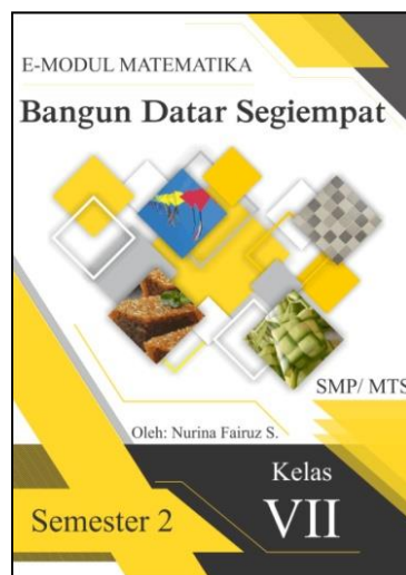
Figure 1. Front Cover of Mathematics E-Module

In this stage, the preparation of an open-ended-based mathematics e-module on the quadrilateral material for grade 7 Junior High School. The cover is made with the Corel Draw application so that it looks more attractive by paying attention to colors, images, fonts, and layouts so that the appearance obtains according to the desired design. The modules are arranged using Microsoft Office Word so that the modules are more systematic. E-module creation using the Kvisoft FlipBook Maker Pro application, as shown in Figure 1.