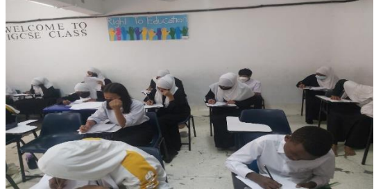
Figure 3. Refugee student in class in Save School Malaysia