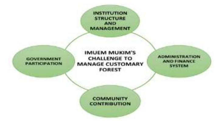
Figure 4. Imuem Mukim's challenge in managing Aceh Jaya's Mukim Customary Forest

Based on the figure above, these challenges are as follows: Institutional Structure and Management, The absence of official legality from the government and a standardized management structure in the structure and management of the mukim institution is a challenge for the mukim government to be able to carry out its obligations, powers and functions effectively. Mukim Siem's governing institutions now face fundamental and significant problems. Administrative and financial systems, Mukim governments in Aceh still use customary administrative systems, meaning that they still use closed management, administration is disorganized, careful and measurable planning does not exist, and the various activities carried out and the overall management process of customary institutions are not evaluated. District/city and provincial governments do not provide definitive assessments. As a result, mukim institutions do not have sufficient operational funds to carry out their roles and authorities effectively. Government Participation, Mukim governments have not benefited from the full involvement of the central, provincial, and district/municipal governments.