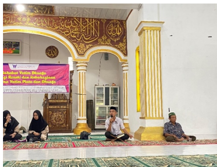
Fig. 1. Lecture Delivery

"I usually participate in this compensation program because the ustadz's lectures are touching. When he explained the virtues of alms and how they bring blessings, I felt compelled to contribute more."