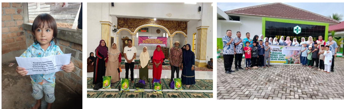
Fig. 3. Orphan Friends Program

Thus, communication strategies are not only a means of delivering program information, but also a social da'wah instrument that is able to internalize Islamic philanthropic values in the practice of people's lives. The practice carried out by Sahabat Yatim Dhuafa Buay Pemaca shows that local philanthropic institutions are able to implement sharia philanthropic programs in a sustainable manner through the right communication strategy.