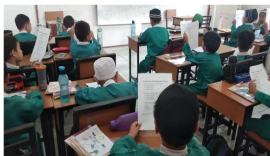
Figure 2. Students fill in feedback after participating in PkM activities

Handouts contain explanations of the content presented by the PkM team. An explanation of the importance of web security starts from how to browse the web safely, the characteristics of malicious programs, viruses, or spam that must be avoided as well as solutions so that devices (laptops/smartphones) are protected from malicious programs. Participants (primary school students) are reading PkM material provided by the PkM team.