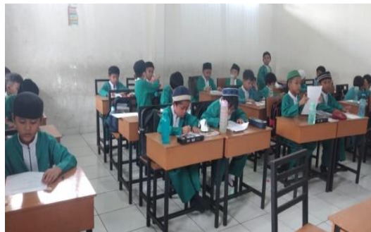
Figure 1. The atmosphere of PkM activities

The Zaadul Ma'ad Boarding School teachers agreed to the proposed PkM proposal. The Zaadul Ma'ad Boarding School teachers welcomed this PkM activity. PkM activities are carried out according to the planned schedule, on November 29 2023 in the Zaadul Ma'ad Boarding School classroom. The participants in PkM were very active in listening to the presentation and also reading the handouts given by the PkM team as seen in Figure 1.