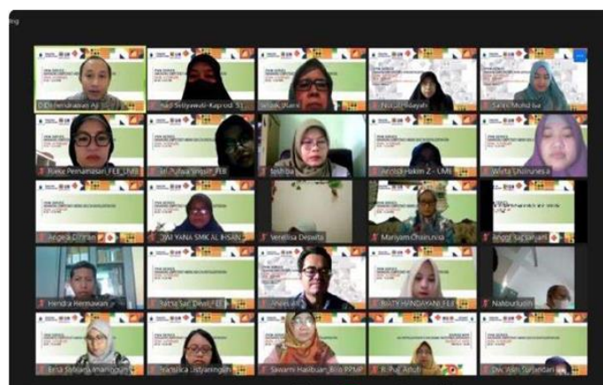
Figure 2. Online Activity of Community Services

In addition to Islamic stock, the socialization activities also explained how to carry out the screening process in determining that the shares were included in Islamic stock. At the same time, the Islamic stock screening process includes business screening and financial screening. Some documentation of the implementation of community service activities in the form of socialization and counseling to increase the knowledge of the young generation related to Islamic investment, Islamic capital market, and Islamic stock are as shown in Figure 2.