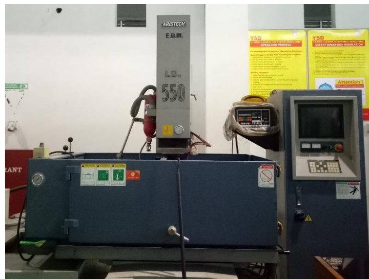
Figure 1. Electrical Discharge Machining Sinking

The material used as a workpiece in the experiment is AISI P20 with dimensions of 25 mm × 25 mm and a thickness of 20 mm. The electrode material is made from copper and graphite. The machining process is carried out with depth of 0.5 mm. Ariztech ZNC LS 550 EDM sinking machine is used in the experiment as shown in Figure 1. While the measurement of surface roughness was carried out using the Surfest Mitutoyo SJ-310.