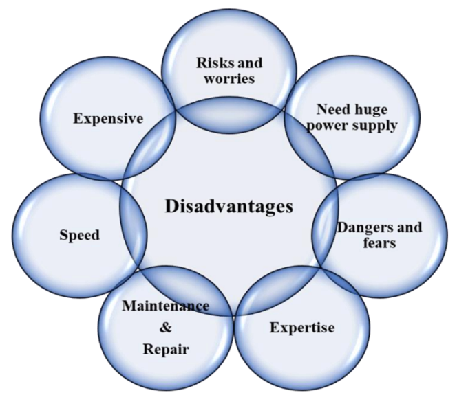
Figure 2. Disadvantages of robotics in pharmacy

Robotic pharmacy technologies are expensive, although the addition of robotics can improve efficiency & productivity. Pharmacy automation systems can't replace pharmacists if you implement a new technology that limits human interaction. The patients may be reluctant to frequent your pharmacy (Colquhoun, 2010).